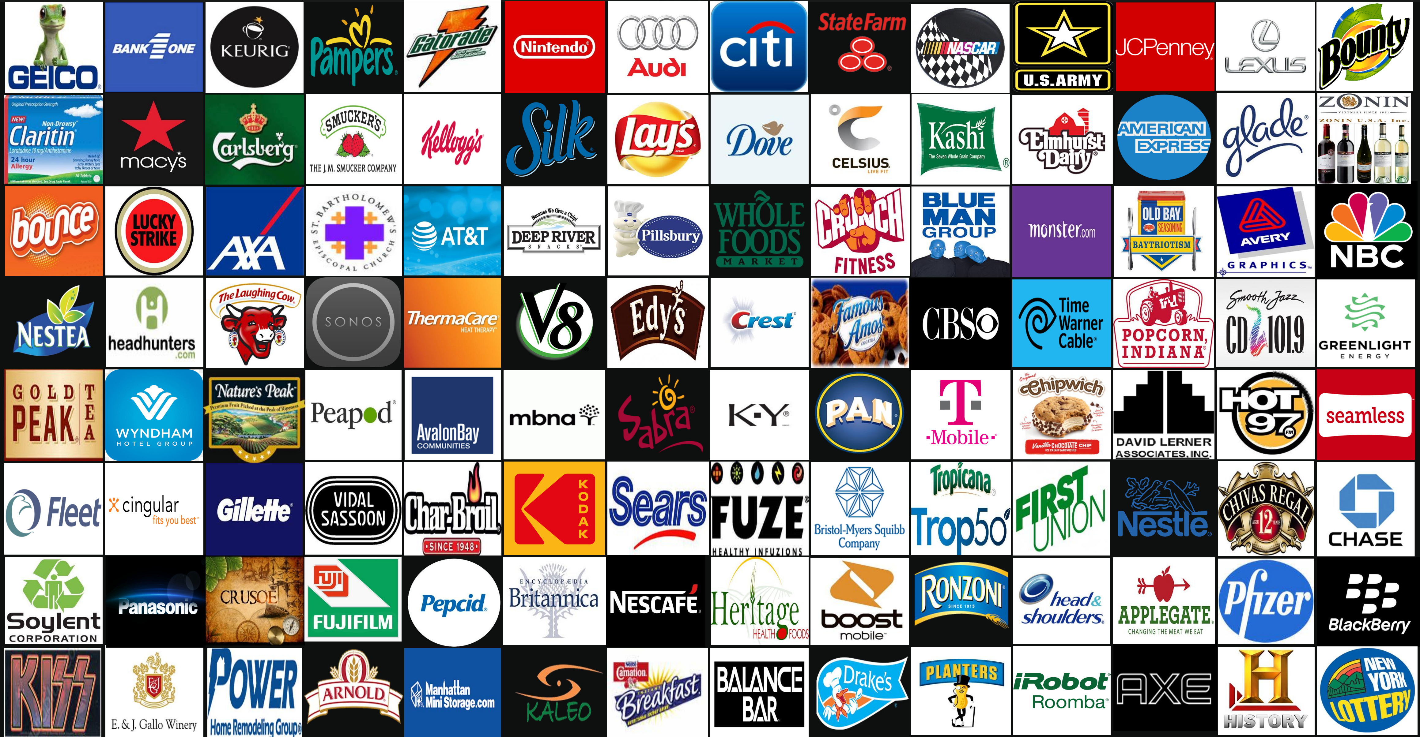
Past and Present Corporate Clients