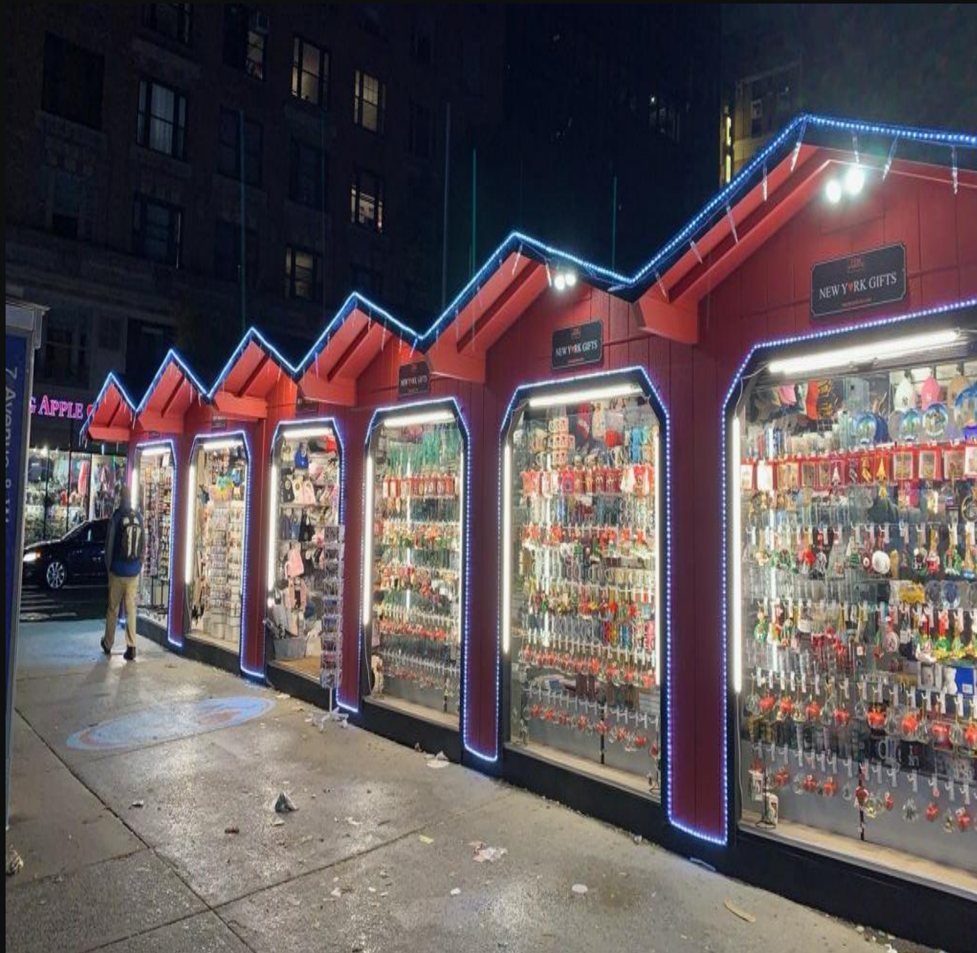
At the Corner of 7th Avenue & 54 th Street