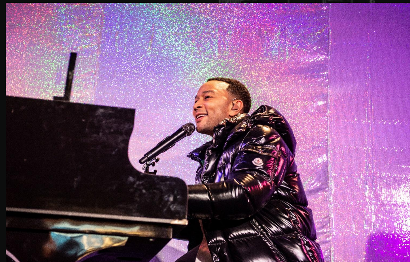
John Legend Performs at Bloomingdale's Holiday Windows Unveiling 2019