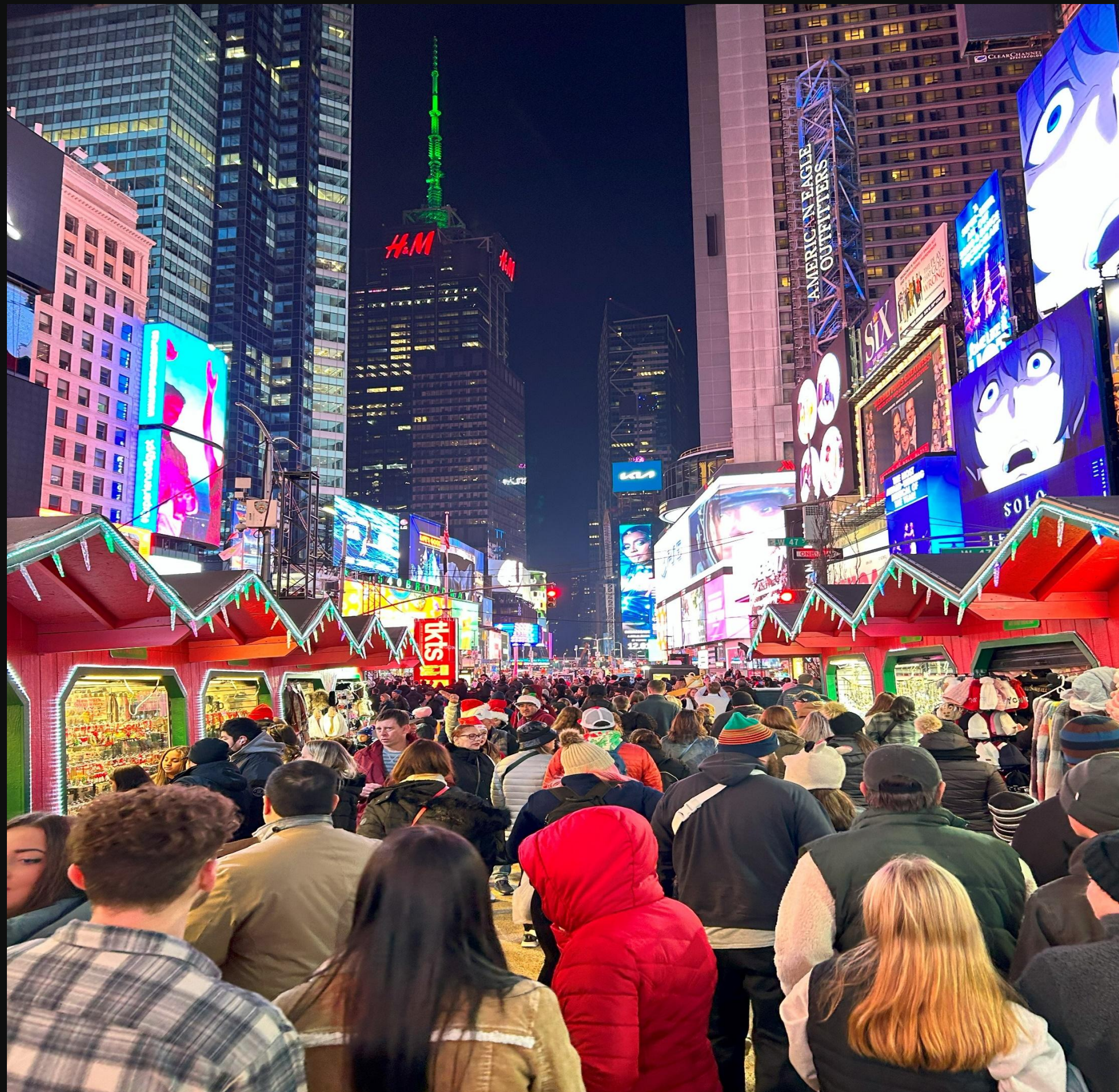
On Broadway between 47 th & 48 th Street