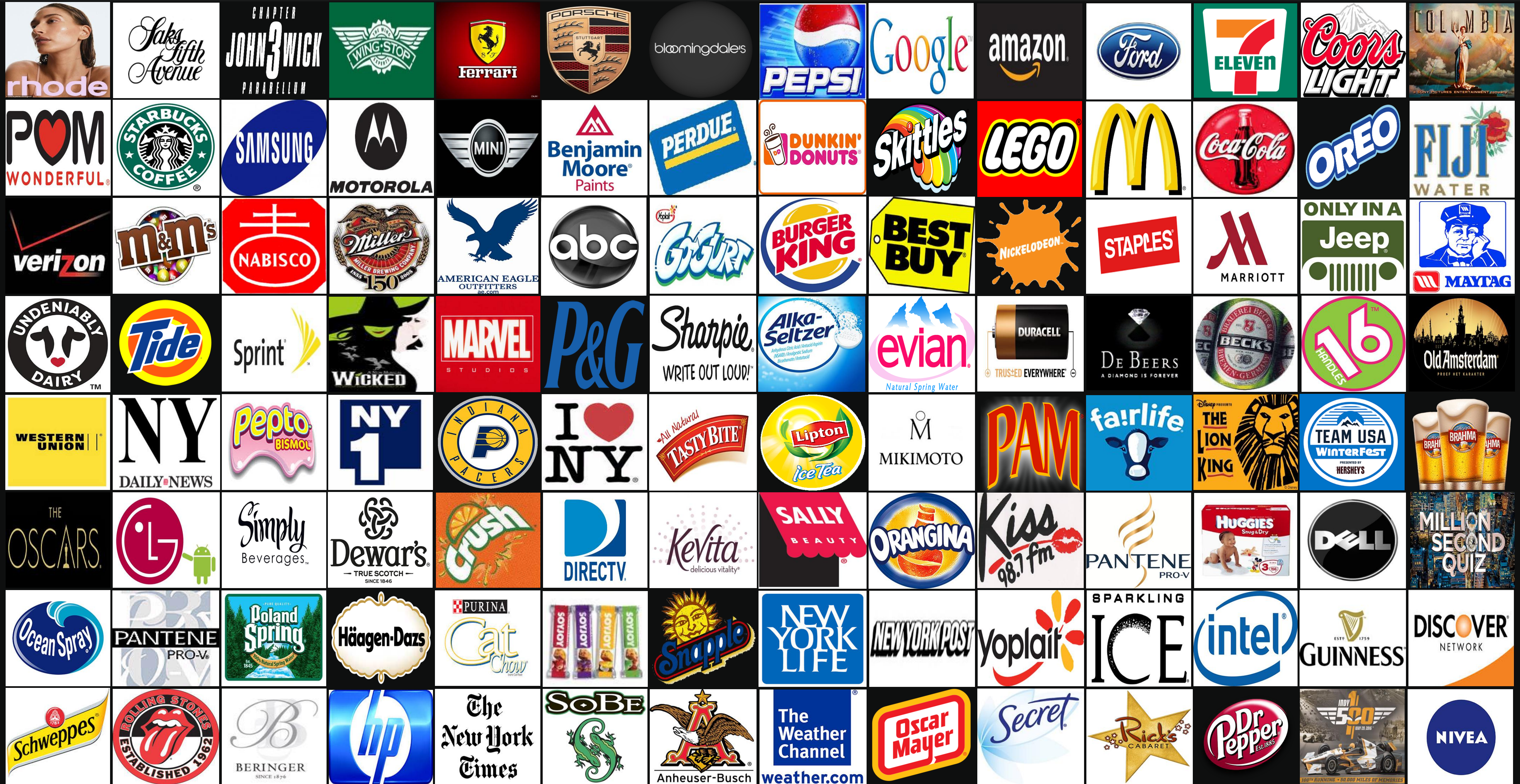
Past and Present Corporate Clients