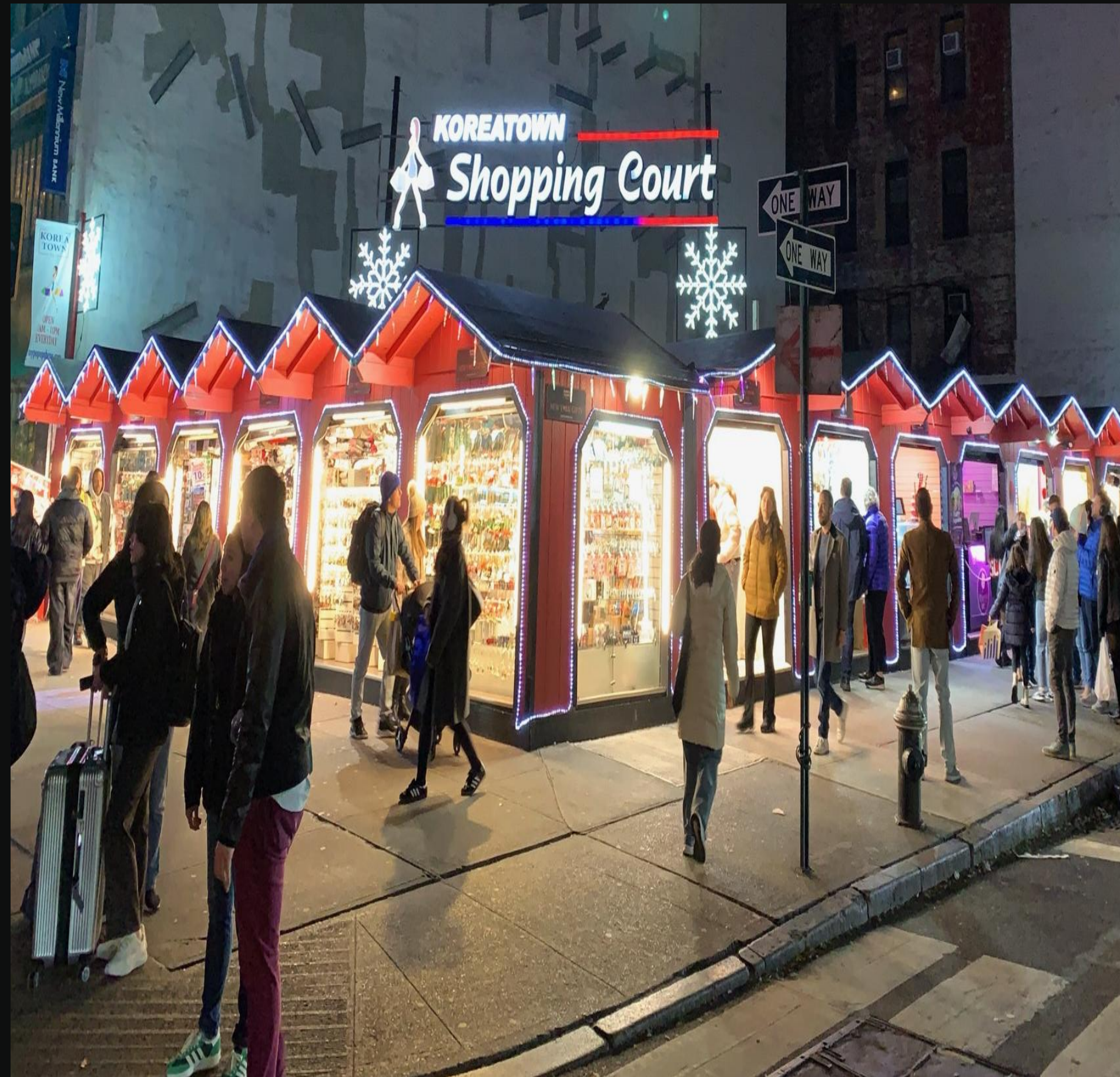
At the Corner of 5 th Avenue & 32 nd Street